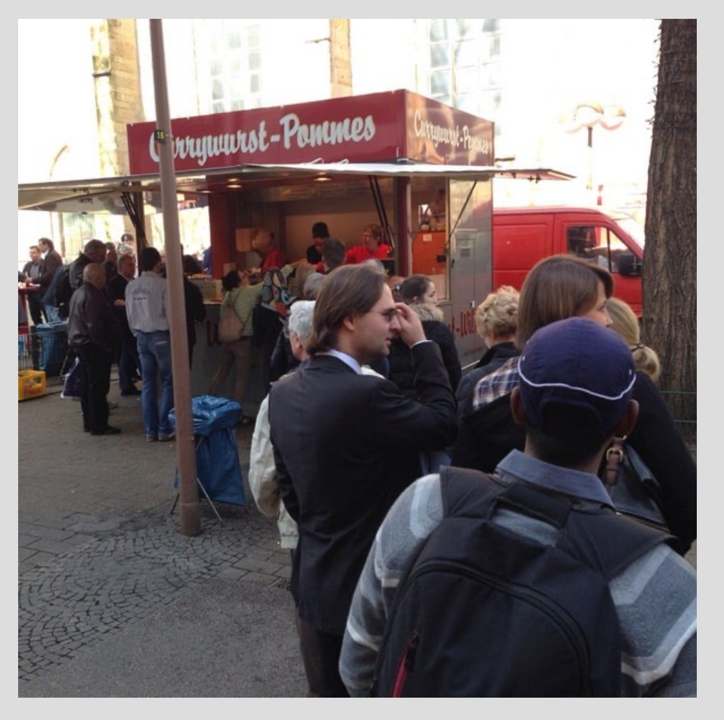
TASTETHE WORLD! The Montana State University International Food Bazaar is an annual event that celebrates the diversity of the MSU student population though a display of cuisine and culture.