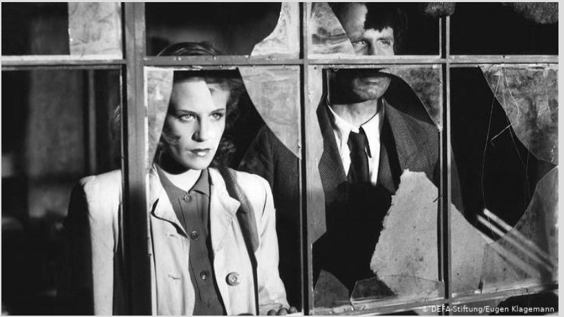
HSTR \ 391 = 1946 - today

HSTR 391: The Holocaust in Film & Memory *Online